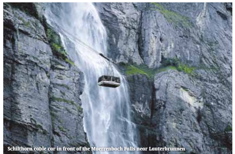
Schilthorn cable car in front of the Muerrenbach Falls near Lauterbrunnen

featured in the James Bond film "On Her Majesty's Secret Service" (in the Tourist-orama you can watch extracts of this 007 movie which was filmed here in late 1968). Piz Gloria turns around its axis in 50 minutes, allowing a breathtaking view! The Schilthorn is reached by a series of cable-cars from the valley floor at Stechelberg, via Gimmelwald and Mürren, on a breathtaking ride up to Birg and then the Schilthorn summit. The Mürren-Schilthorn area is a magnificent hiking region! The rich variety of alpine flora, combined with breathtaking views of snow-covered Alps, dominated by the Eiger, Mönch and Jungfrau, guarantee you an absolutely unfor-