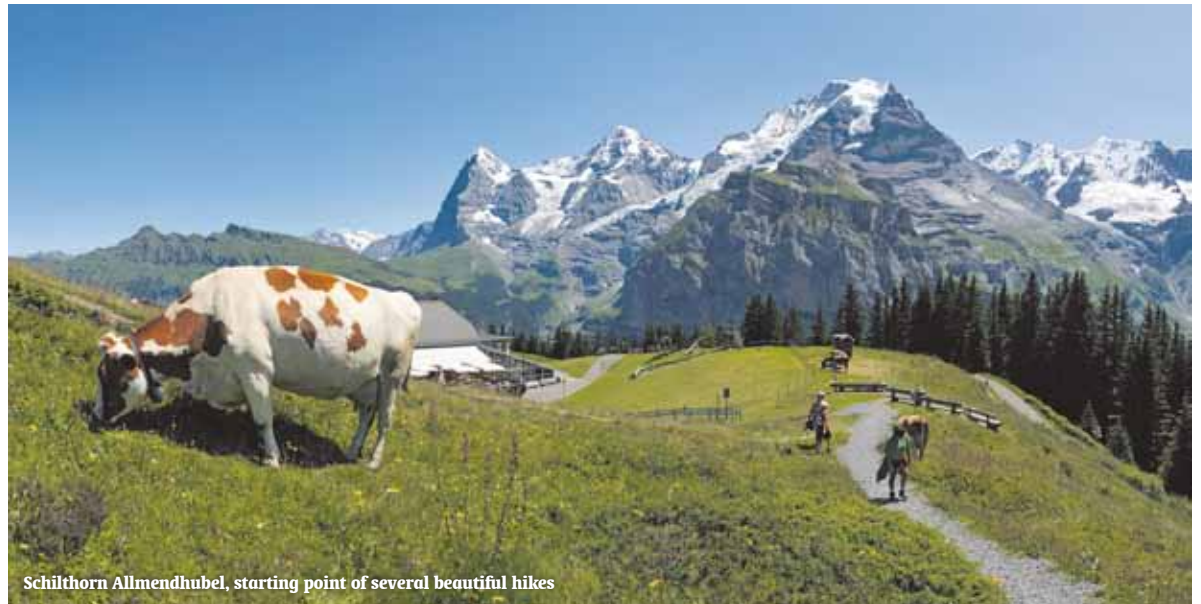
Schilthorn Allmendhubel, starting point of several beautiful hikes

Kleine Scheidegg (2,061 m), the pass between Grindelwald and Lauterbrunnen Valleys, lies directly beneath the towering trio of the Eiger, Mönch and Jungfrau. From here, the Jungfrau Railway begins its remarkable journey to the Jungfraujoch – Top of Europe. You’ll meet Alpine herdsmen with their cattle, climbers preparing to attempt the Eiger