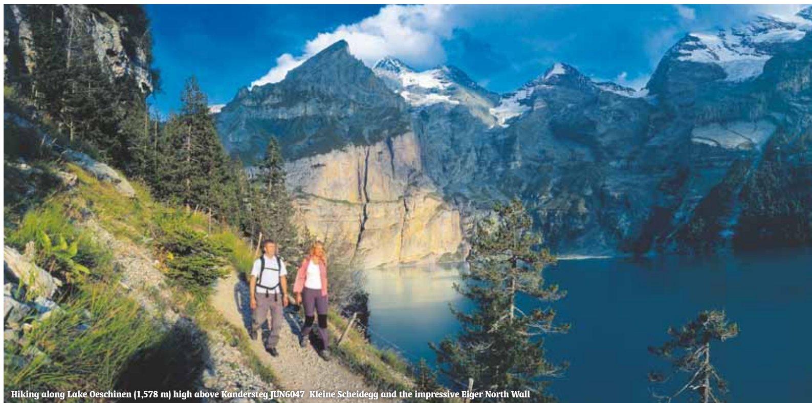
Hiking along Lake Oeschinen (1,578 m) high above Kandersteg JUN6047 Kleine Scheidegg and the impressive Eiger North Wall