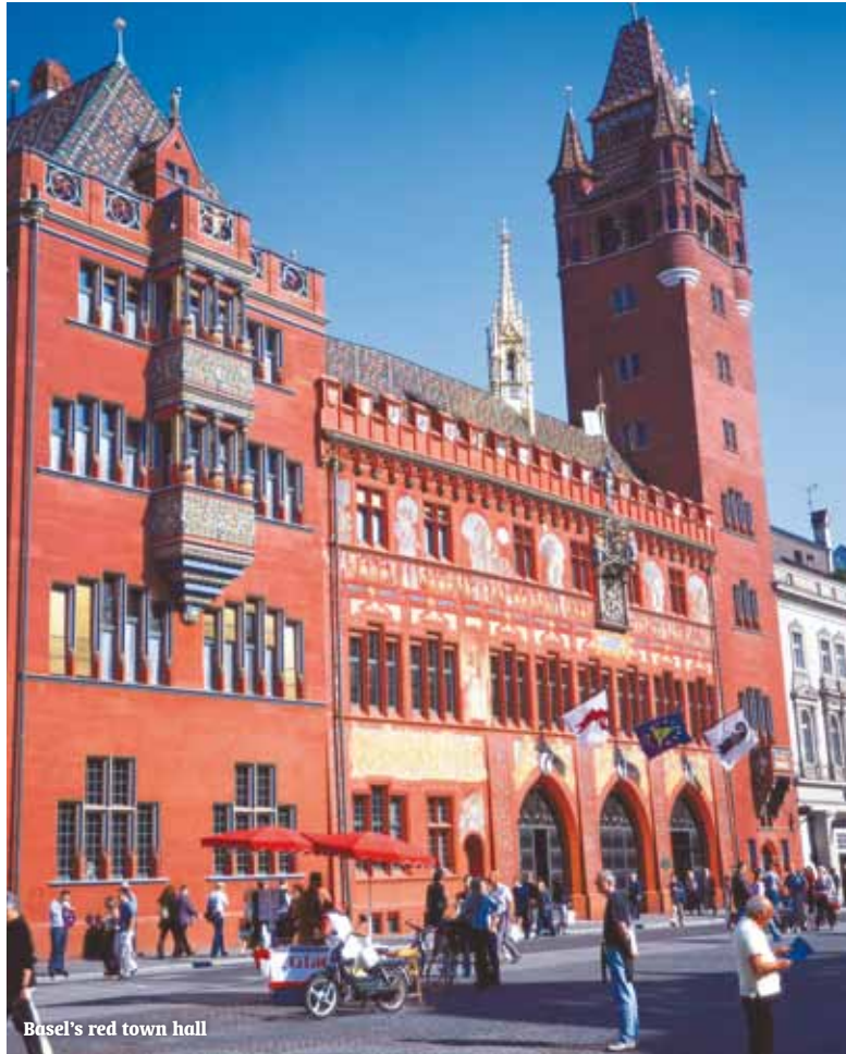
Basel's red town hall

The Basel Card costs for 24h CHF 20.– (without means of transport) or CHF 25.– (incl. means of transport), for 48h CHF 27.–, and for 72h CHF 35.–. It gives you free admission to some museums and to the zoo, free guided tours of the town, free ferry rides, reductions for concerts and discos, reductions in various shops, a 30% reduction on car rental and reductions on boat trips and taxi fares.