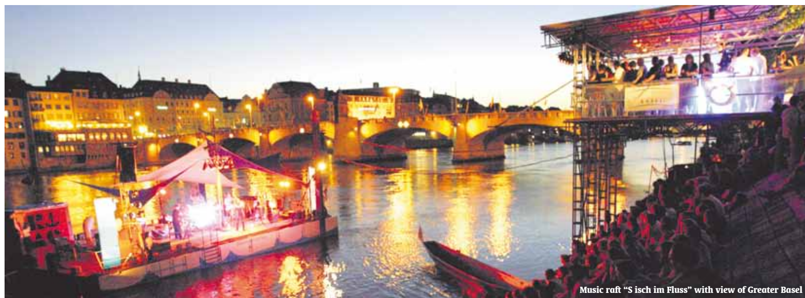
Music raft “S’isch im Fluss” with view of Greater Basel

to the “August” stop, from there a 10-minute walk. Or by boat from Basel-Schifflande to “August” or “Kaiseraugst” (summer only, call 061 639 95 07); from there a 15-minute walk to the Roman Museum (journey time from Basel: 1½ hours). Opening hours: outdoor exhibitions and the farm animal park are open daily 10 am – 5 pm; the Roman Museum open Tue – Sun 10 am – 5 pm and Monday 1 pm – 5 pm. You can visit most of the sights of August Raurica free of charge . Entry to the Roman Museum and the Roman House costs CHF 7.–, students CHF 5.–.