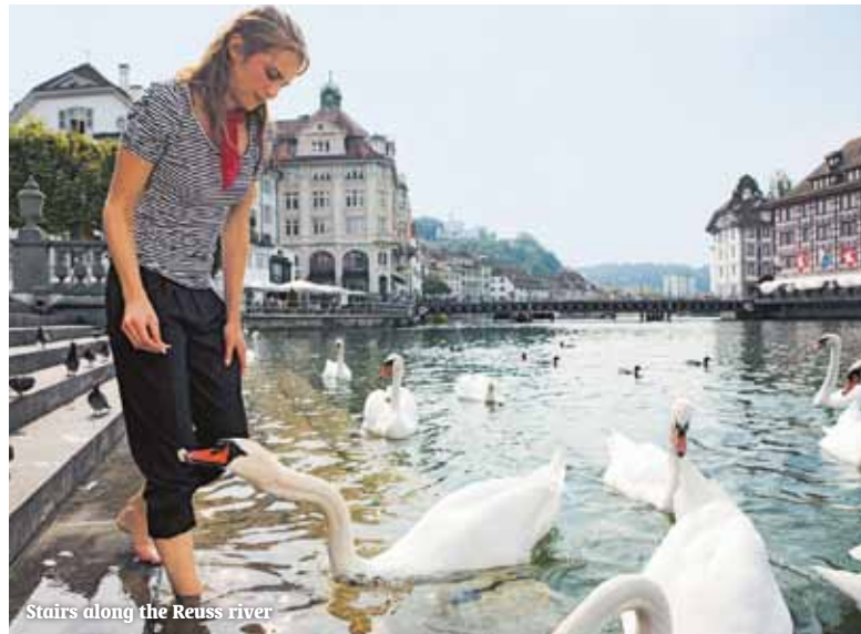
Stairs along the Reuss river

How to get there: Hergiswil is only 10 minutes by train from Lucerne. At the Glasi Hergiswil you can also visit a great exhibition on art glass production, with museum, shop and show, free of charge (see page 50). Open Mon – Fri 9 am – 6 pm, Sat 9 am – 4 pm.