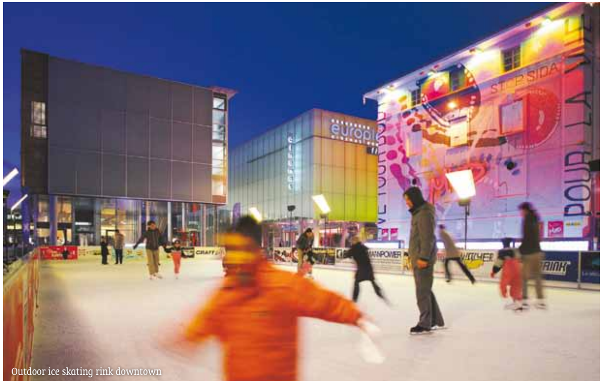
Outdoor ice skating rink downtown

Lausanne resides on the hillside between Lake Geneva below and the woods above, surrounded by meadowland and vineyards, facing the Alps. Lausanne was officially named the Olympic Capital in June 1994, a unique and prestigious title awarded by the International Olympic Committee, headquartered in Lausanne since 1915. Popular with students, Lausanne features numerous private schools and one of the country's largest university campuses, comprising the Federal Institute of Technology (EPFL) and the University of Lausanne. Lausanne has more to offer young people than most Swiss cities: nightlife, bars, bistros, discos... many museums and collections stage more than 50 exhibitions a year, from dinosaurs to contemporary art.