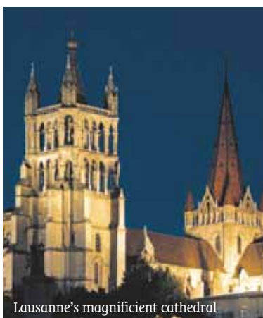
Lausanne's magnificent cathedral

3 Lausanne-guesthouse & backpacker, Epinettes 4 (021 601 80 00) »www.lausanne-guesthouse.ch; 4 Lausanne Youth Hostel "Jeunotel", Chemin de Bois-de-Vaux 36 (021 626 02 22) »www.youthhostel.ch/lausanne