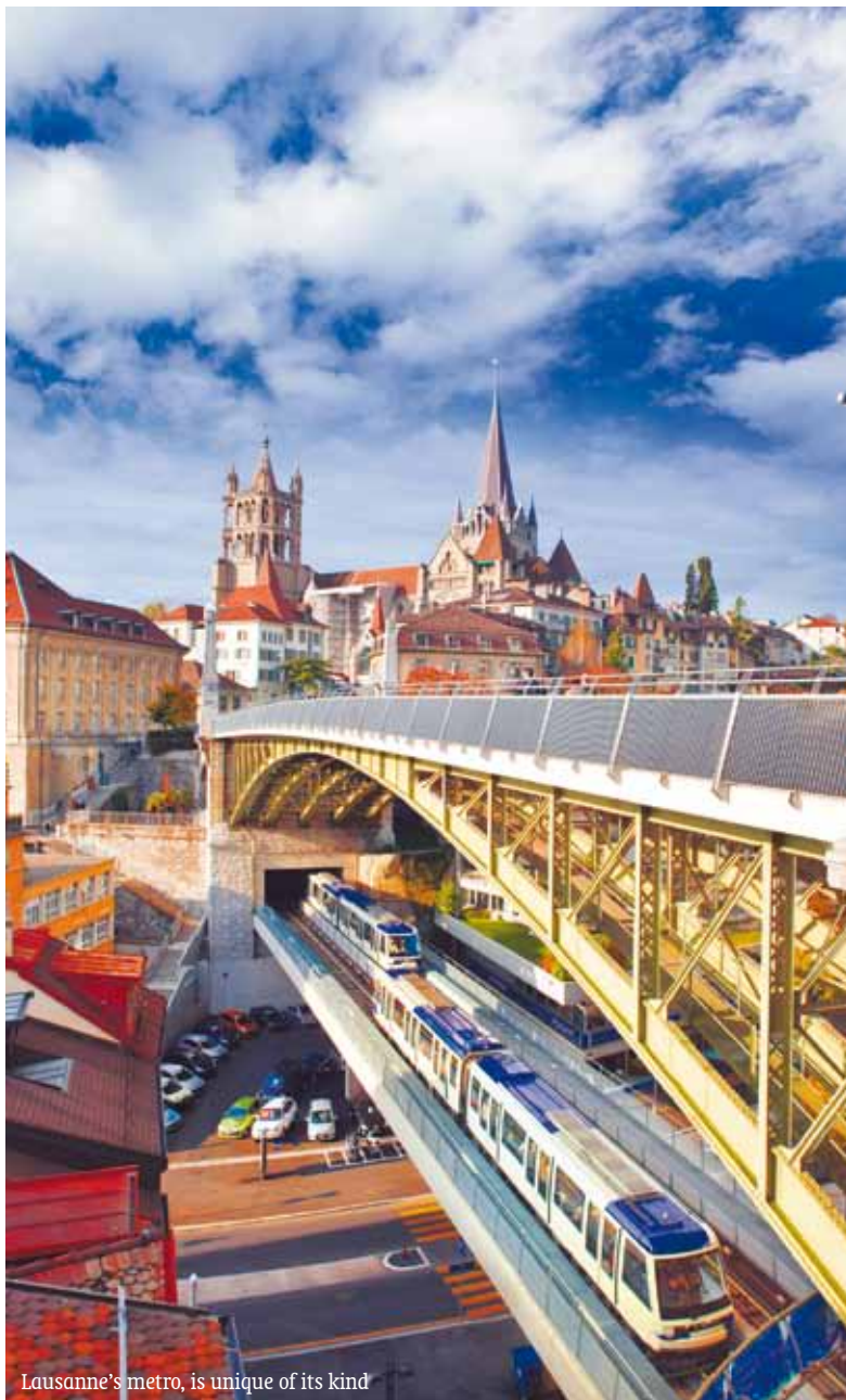
Lausanne's metro, is unique of its kind