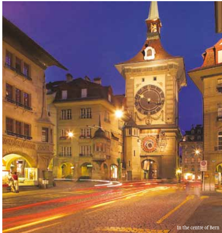
In the centre of Bern

B ern is perhaps the most immediately charming city in all of Switzerland. The country's political and diplomatic capital has been listed as a UNESCO World Heritage . For all its political status, it is a tiny city and the attraction of the place rests in its ambience. You could spend days just café-hopping and wandering the streets with its arcades and street fountains. Einstein developed his special theory of relativity here and it was from here that the famous Emmentaler cheese was first sent on its way to conquer the world.