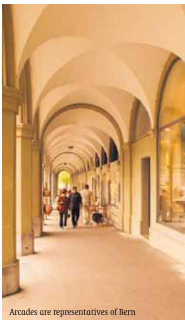
Arcades are representatives of Bern

❸ Bern Backpackers / Hotel Glocke, Rathausgasse 75 (031 311 37 71) »www.bernbackpackers.ch; ❹ Hotel Landhaus, Altenbergstr. 6 (031 348 03 05) »www.albertfrida.ch; ❺ Berne Youth Hostel, Weihergasse 4 (031 326 11 11) »www.youthhostel.ch/bern; Etap Hotel Bern Expo, Am Guisanplatz 4 (031 335 12 12) »www.etaphotel.com