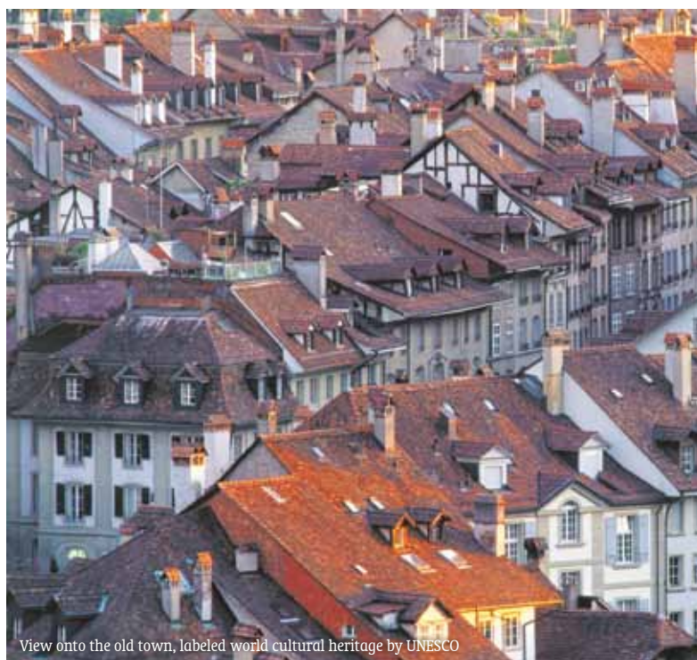
View onto the old town, labeled world cultural heritage by UNESCO