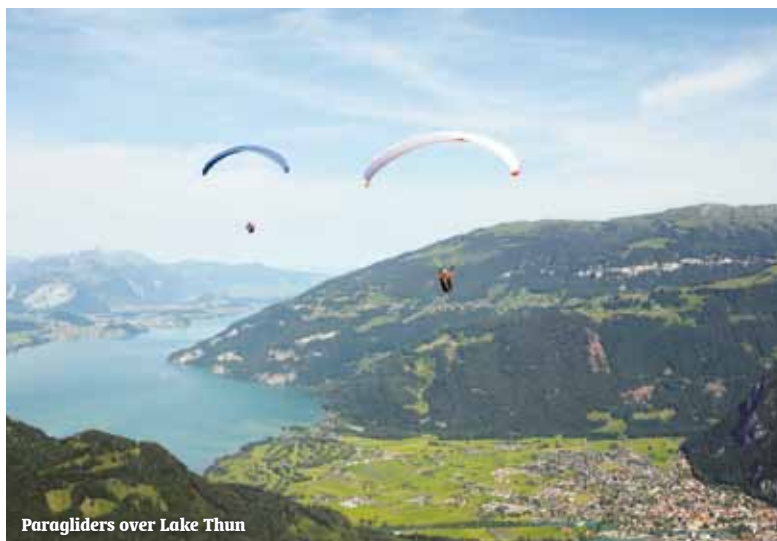
Paragliders over Lake Thun

Interlaken is the heart of Switzerland's adventure activity scene, located in the center of the Bernese Oberland. The closeness of the mountains and the view of the three world-famous peaks Eiger, Mönch and Jungfrau (Top of Europe) , equally add to the beauty of the area. Excursions to the highest railway station in Europe, the Junfrauoch (3,454 m / 11,333 feet), and to one of the most exclusive view points in the alpine world, the Schilthorn peak , can easily be made from here. It is nothing extraordinary for a city to be situated by river, lake or sea. But that it is, like Interlaken, between two lakes – Lake Thun and Lake Brienz – is practically unique. And Interlaken is the number one resort in Europe for adventure and fun! At each hostel you can book outdoor activities. It is worth staying several nights here enjoying the fabulous nature and exciting adventure possibilities!