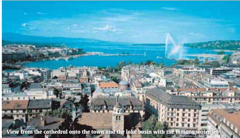
View from the cathedral onto the town and the lake basin with the famous water jet

The City Hostel is also an issuing office for Swiss train passes i.e. the Swiss Pass/Swiss Youth Pass. For details about the Swiss train passes see page 5 .